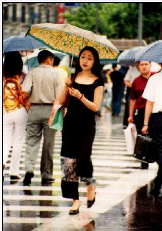
It's raining in China

Out on Soi Twenty Two, groups of little ladies with their colorful umbrellas are stranded under the awning of the Seven-Eleven store in its' fluorescent light, hoping an empty taxi will come by. Some are lucky enough to have gotten into one and are viewing the ongoing devastation from within a secure and dry protective bubble. One that isn't going anywhere quickly for a little while! The sound of the rain falling heavily is a steady roar that speeds up and slows down periodically like a freight train. The mighty fortresses like the Queenspark Hotel are resolutely standing with their lights burning, protecting all the travelers who need shelter. Will this be