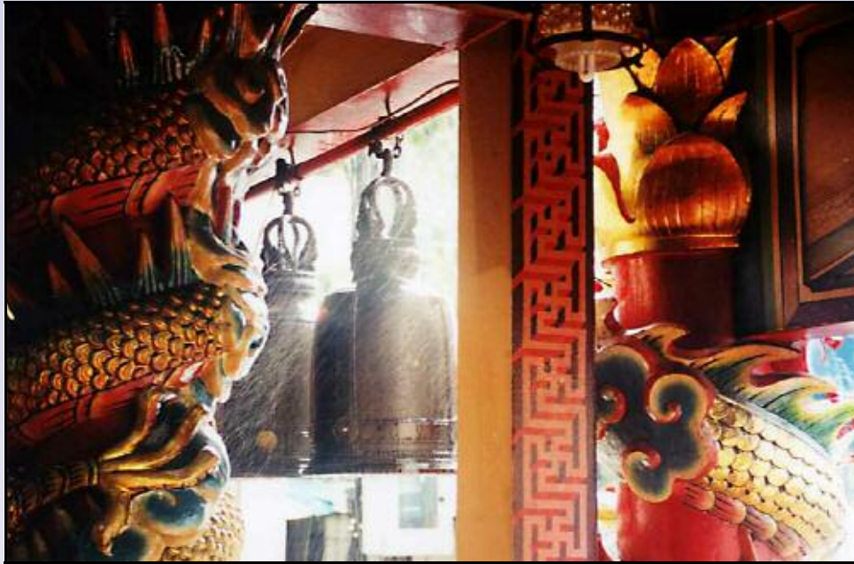
Taking refuge behind the temple

pillaging and flooding. It's almost completely dark and the invading storm has the city completely in its' power. No one can move about any street or yard. I've turned out all the lights and I'm sitting on